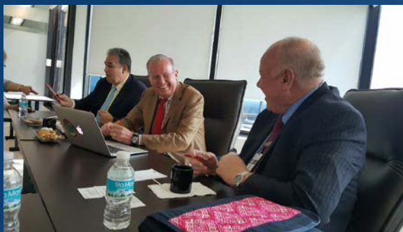
G. Director Mexican Space Agency