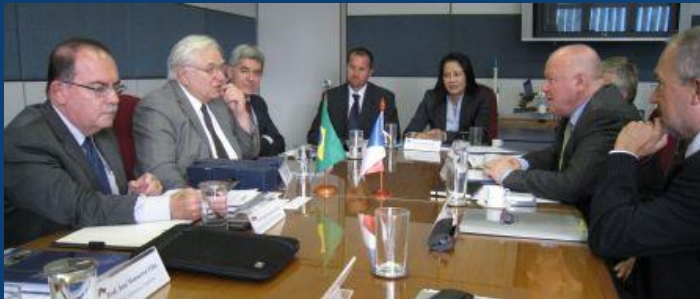
President Brazilian Space Agency AEB